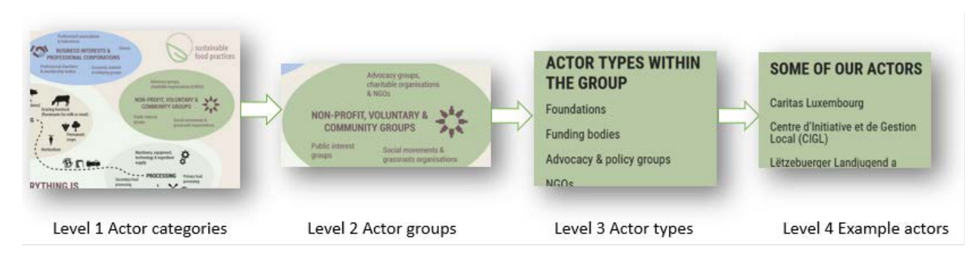
Figure 3: The levels described

Example actors illustrate the descriptions of food system actor groups and actor types. Example actors are placed in the actor group/type reflecting their main activity for illustrative purposes. In reality, some actor examples may undertake multiple activities in the food system. Not all groups/types display actor examples for various reasons, nor are the lists of examples exhaustive or aimed to be a directory. Example actors with several main activities may be shown in more than one actor group or type, if no other example actor was found or if an example actor has two or more main economic activities. There may be, and probably are, more example actors than the ones provided. In some cases, we have refrained from providing example actors, where examples are not needed for illustration, or where we are unable to in terms of data protection or other reasons. In the particular case of 'Natural environment', no actor examples are provided for the entire actor category for the reason that the Natural Environment provides the natural resource base for all other food systems activities.